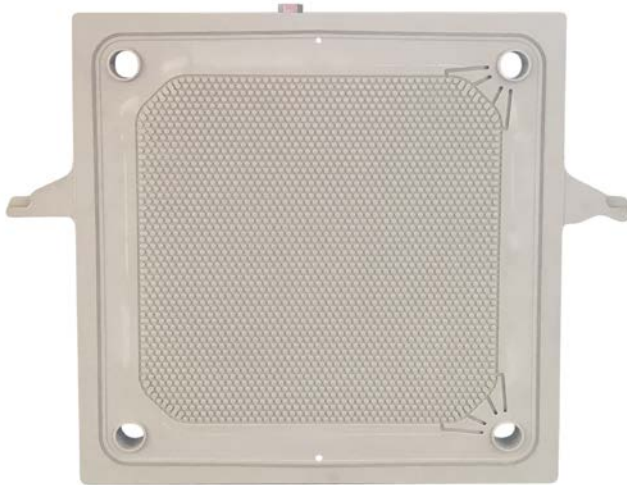
Membrane plate HERMETIX 1000 P